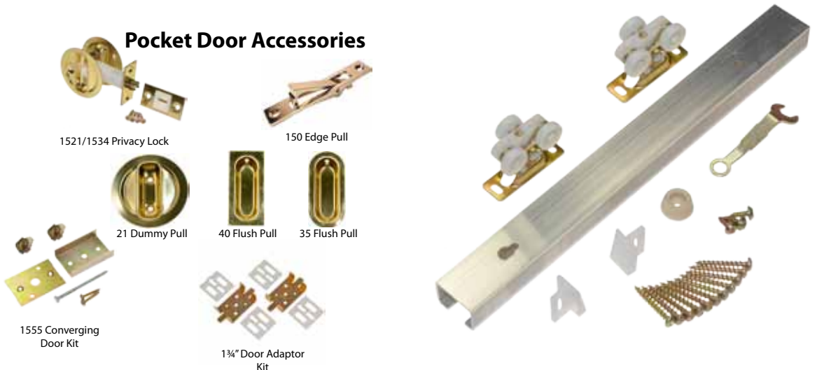
1521/1534 Privacy Lock