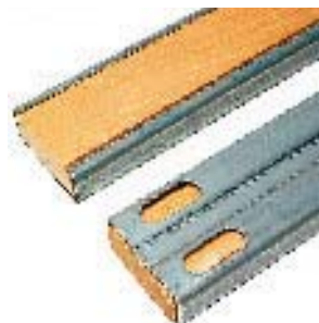
Steel-Wrapped Split Studs

Includes all hardware listed for 2060 Extra Heavy-Duty Pocket Door Frame, but comes with steel-wrapped split studs instead of all steel split jambs. Heavy-gage galvanized steel sides and backs ensure rigidity and protect against accidental nail penetration.