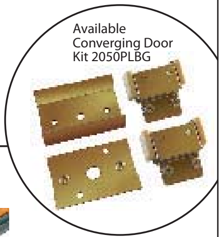
Available Converging Door Kit 2050PLBG

Jamb Mount Door Guide Set Molded nylon guides hold door in place and ensure smooth operation.