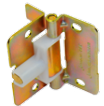
1711 Jamb Bracket